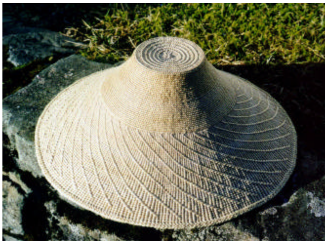
Figure G-4. Unpainted spruce root hat.