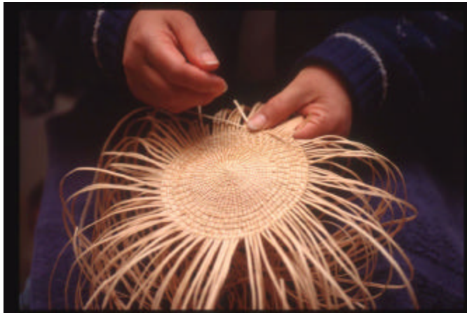
Figure G-3. Weaving spruce roots.