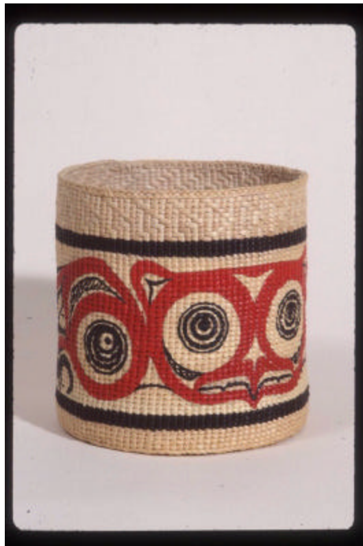
Figure G-6. Owl basket made from spruce root gathered at the airport.