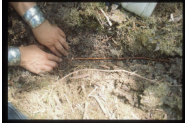
Figure G-1. Gathering spruce root at the Juneau International Airport.