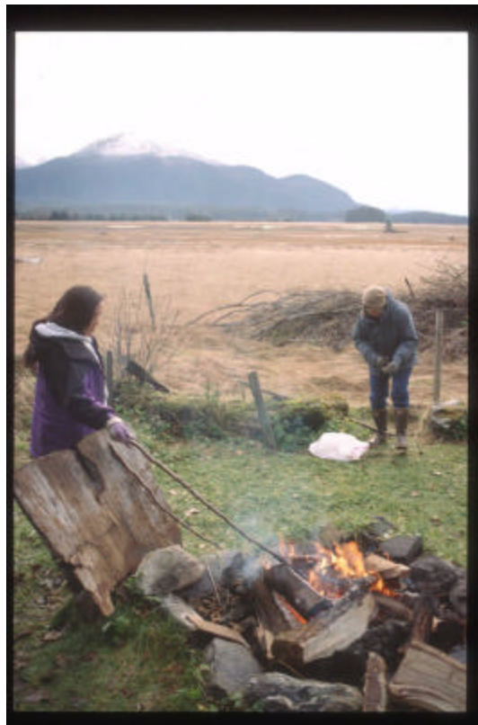
Figure G-2. Roasting roots in preparation for weaving.